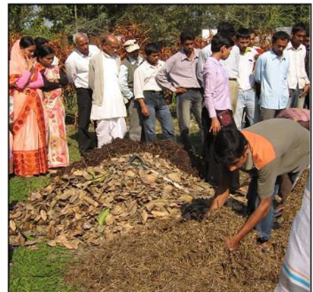
ASP staff demonstrate proper way to preparing compost, a low-cost, effective and natural fertilizer

An organic production system is designed to work constructively with natural biological cycles and to operate with minimal external inputs .